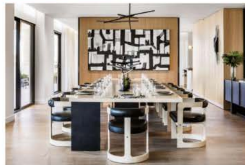
Top: A chandelier by David Weeks Studio has a mobile effect in the study, with photographs by Magdo van Hanou. Bottom: A steel-base table paired with Kelly Wearstler side chairs anchor the dining area, where a Billy Cotton chandelier and Marco Lorenzetto's Labirinto add effervescent notes.