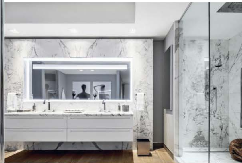
Opposite: Photographs by Rick Rose provide another (virtual) view in the master bedroom, with a sand-effect bespoke rug in viscose. Top: Ultra-clear Starphire glass and a floating vanity with integrated LED lighting add cool in the Carrara-marble-clad master bathroom. Bottom: Custom wall panels pair with rift-cut oak in another guest bedroom.

MIAMI: ANGLED SOFAS. J. SAMUEL AT JEFFREY MICHAELS: SOFA FABRIC. CUSTOM ARMCHAIRS. MILANO UPHOLSTERY: STRAIGHT SOFA FABRIC. KELLY WEARSTLER AT MONICA JAMES & CO: BARREL CHAIRS. MERIDA: RUG. LIVING AREA PHILIP MICHAEL WOLFSON: COCKTAIL TABLE. ROBICARA: NESTING TABLES, CURVED COCKTAIL TABLES. WILLIAM HAINES DESIGNS: ARMCHAIRS. LUMIFER: OCCASIONAL TABLES. JAY SCOTTS COLLECTION: PLANTERS. ROMO AT MONICA JAMES & CO: CUSTOM BARREL BACK CHAIRS. GUEST BEDROOM FLOS AT LUMENS: SCONE. KITCHEN BOFFI: CABINETRY. ARTERIORS: PENDANT LIGHTS. KELLY WEARSTLER: STOOLS. DORNBRACHT: SINK FITTINGS. DINING AREA BILLY COTTON: CHANDELIER. ROBICARA: TABLE, SIDEBOARD. KELLY WEARSTLER AT MONICA JAMES & CO: CHAIRS. DELIGHTFULL: SCONES. MASTER BEDROOM JIM THOMPSON FABRICS: HEADBOARD FABRIC. ROBICARA: BEDSIDE CHESTS. CUSTOM COUTURE RUGS: CARPET. SECOND GUEST BEDROOM KELLY WEARSTLER: SCONES. THROUGHOUT ES WINDOWS: FLOOR-TO-CEILING WINDOWS. APURE: CEILING LIGHTS (LIVING ROOM, BATHROOM). HOUSE OF CINDY: BEDROOM PELLOWS.